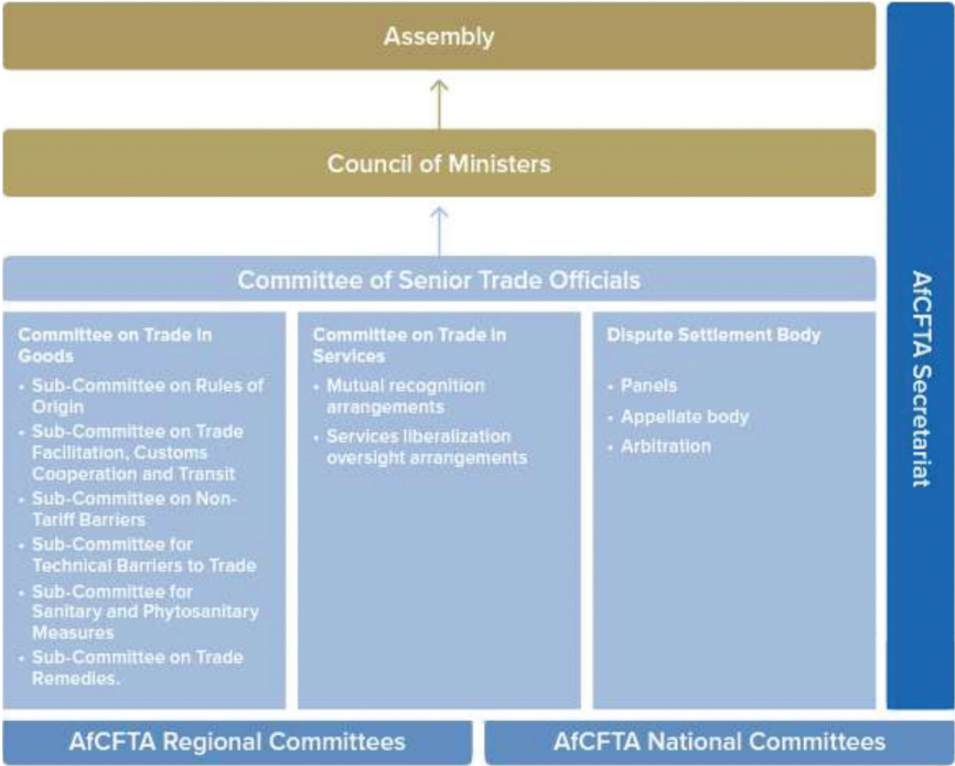
FIGURE 10.1 Institutional framework for implementing the AfCFTA

adds a further dimension to AfCFTA institutional relations. This is particularly so given that the formal place of the RECs and customs unions in the AfCFTA is still being clarified.